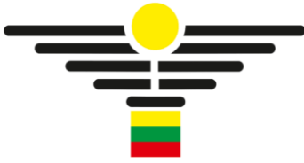
Aeroclub of Ignalina