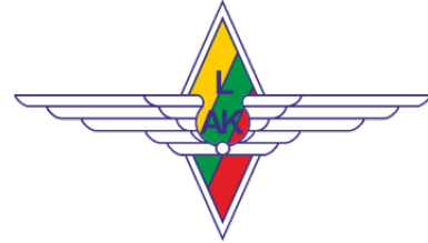
Aeroclub of Lithuania